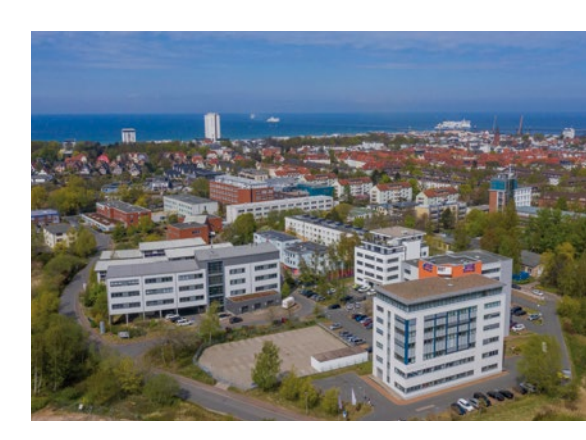
Warnemünde Technology Park