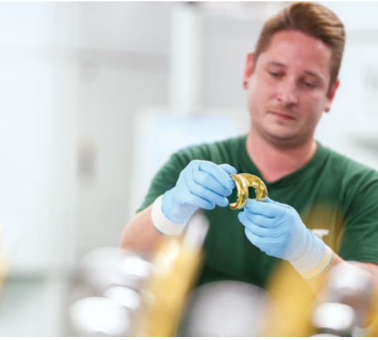
Visual inspection of the implant marking

The key areas include the finishing of implants made of titanium and cobalt chrome alloys, medical steel, ceramics or PEEK as well as instruments from the dental industry. Colour anodizing and laser engraving for clear product identification are just as much a part of the product portfolio as cleanroom packaging.