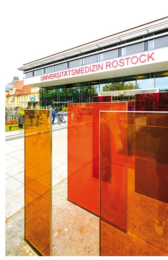
Medical Department of the University of Rostock

The main areas of research at Rostock University Medicine include biomedical technology and biomaterials, neurosciences and oncology. They concentrate on the development of implant systems, innovative neurodegeneration treatments and a comprehensive cancer center (CCC-MV) for high-quality patient care, research and teaching.