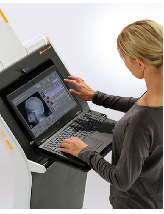
Digital X-ray system Amadeo M-mini Picture on the right: Implants after the coating process