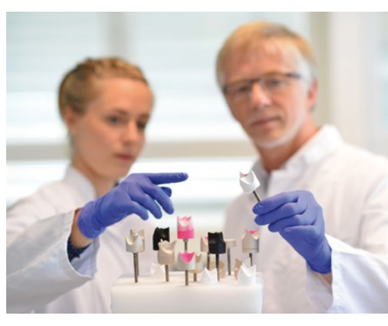
Institute for Implant Technology and Biomaterials