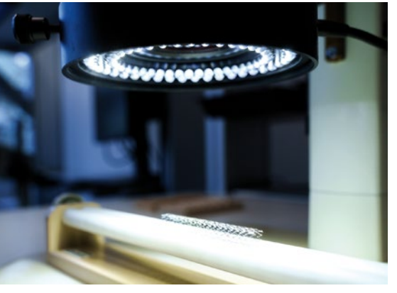
Stent from CORTRONIK GmbH