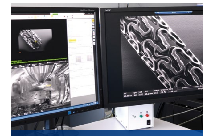
DIGITAL TRANSFORMATION Telemedicine, smart personalized health technology, AI-based health assistants

Diagnostic procedures and products, bioinformatics, biotechnology and active ingredients, biosystems technology