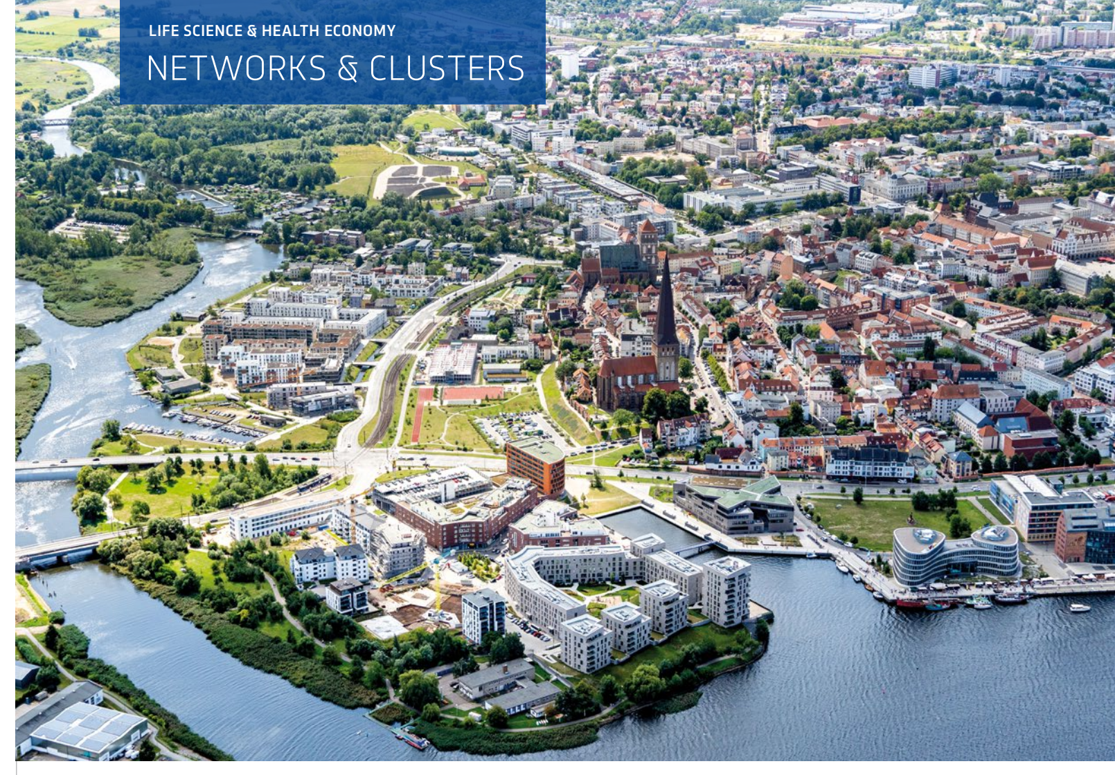
Hanseatic and University City of Rostock