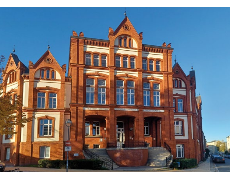
University of Rostock - Institute of Anatomy and Physiology

Rostock is home to important research institutions that are recognized nationally and internationally. The University of Rostock, the Medical Department of the University and the renowned Institute for Implant Technology and Biomaterials form the scientific backbone of the region. By focusing on diverse areas of research and development, they make a significant contribution to the advancement of science, medicine and technology.